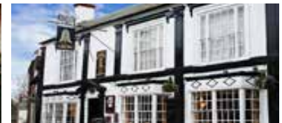
The Bell Hotel Winslow Tel: 01296 714091